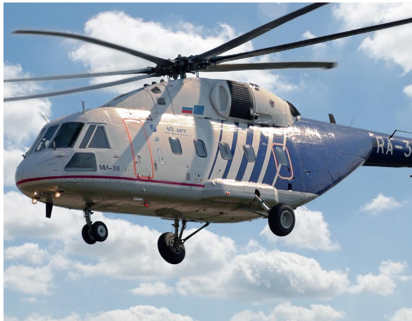
PUREair system for the Mi38 helicopter (prototype unit).