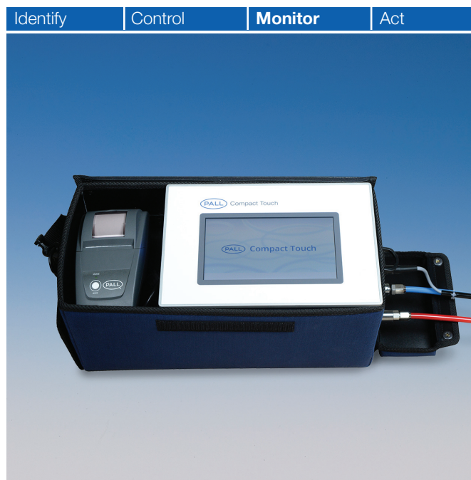
Compact Touch Integrity Test Device CT001

Protect Your Product. Protect Your Brand.