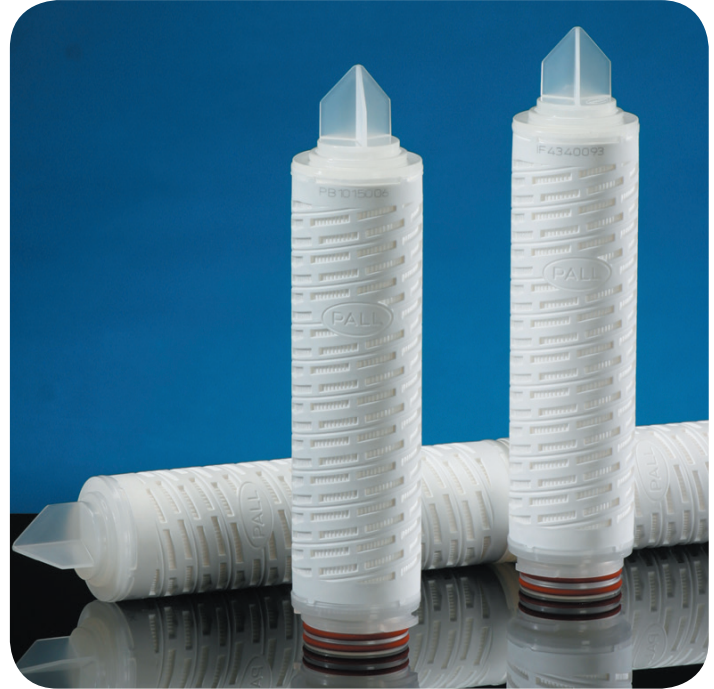
OenoClear Filter Cartridges