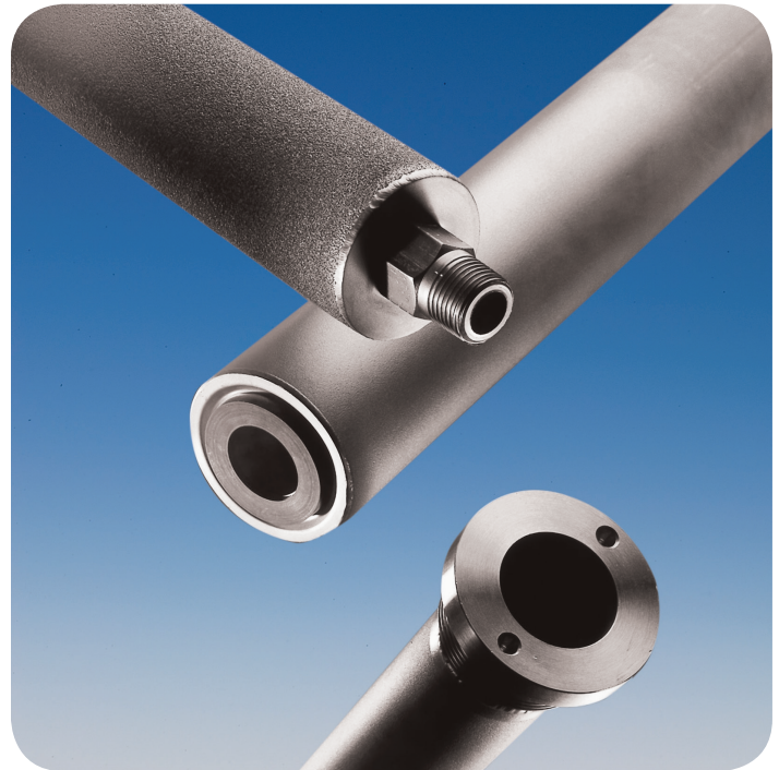
PSS Porous Metal Filter Cartridges

Double open-ended (DOE), flat gasket seals