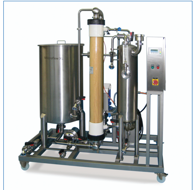
Microflow XL-M Brine system