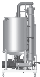
XL-M Side Views

The Microflow XL modules have been qualified for compliance to specific regulatory standards for products coming into contact with foodstuffs. Please contact Pall for details.