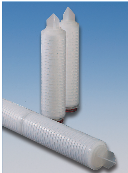
Figure 2: Emflon PFW cartridges are designed for sterilization of large volume gases in compact installations.