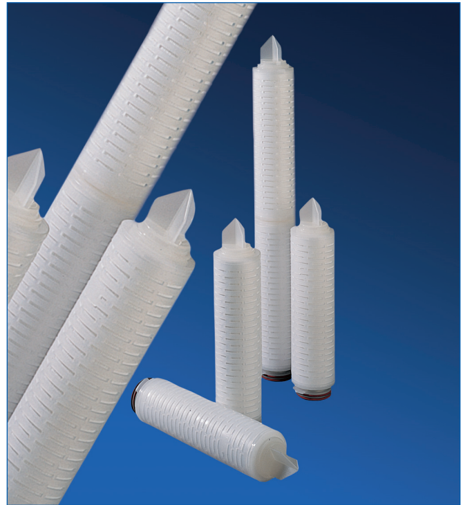
Emflon PFRW Filter Cartridges