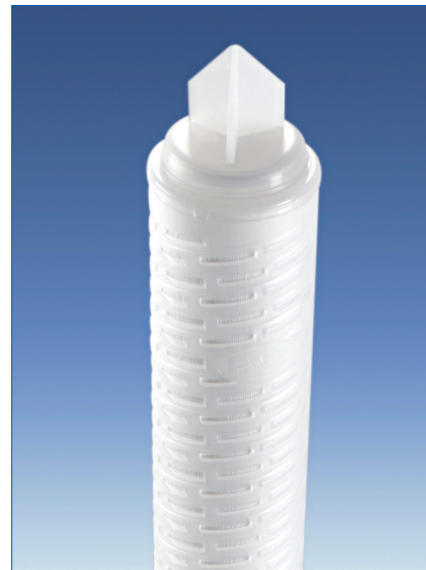
Figure 3: Emflon PFAW cartridges offer exceptionally high flow rates and are used for less critical bioburden reduction in gases.