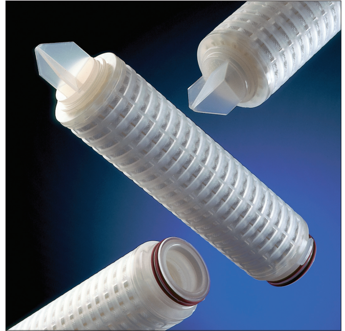
Profile Star Filter Cartridges

Please refer to the Pall website www.pall.com/foodandbev for a Declaration of Compliance to specific National Legislation and/or Regional Regulatory requirements for food contact use.