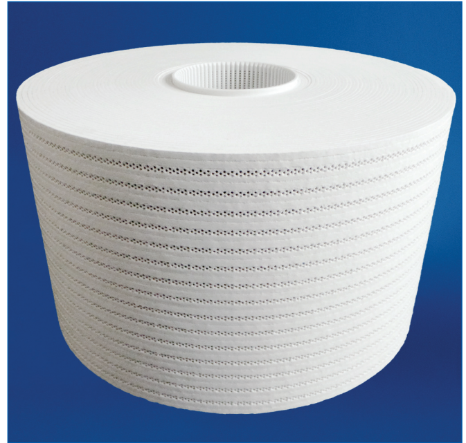
SUPRApak PR Series Modules

1 Depending on application and product selection