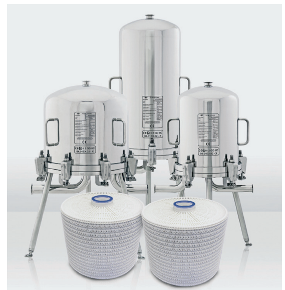
Figure 3: Pall’s WSFZ housings for SD II modules provide flexibility in production. By installing internal center posts of different lengths, filtration can be run at 25, 50, 75 and 100% of capacity. Special adaptors enable retrofitting with SUPRApak modules as production capacity increases.

SD II modules in 287 or 410 mm (12 or 16 inch) diameter size are installed in sanitary lenticular housings holding from 1-4 vertically stacked modules (Figure 3). Flexibility in housing design enables the use of multiple lengths of hardware center posts that make it possible to use from 1.8 to 7.2 m 2 (19.4 to 77.6 ft 2 ) or from 5 to 20 m 2 (53.8 to 215.3 ft 2 ) of modules in the given housing, to accommodate different batch sizes.