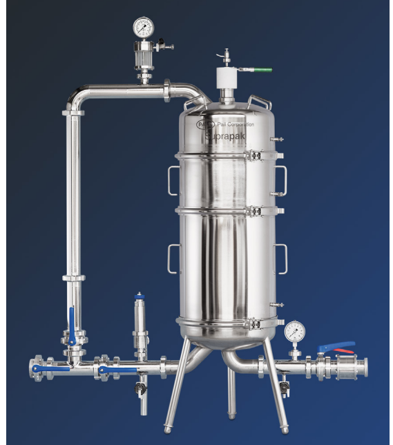
Figure 6: SUPRApak L-421 ( 4-high) housing, shown with standard accessories, can be operated as a 1,2,3 or 4 high housing.

Typical throughputs achieved depend largely on beer filterability, influenced by the same factors as previously indicated for SD II modules.