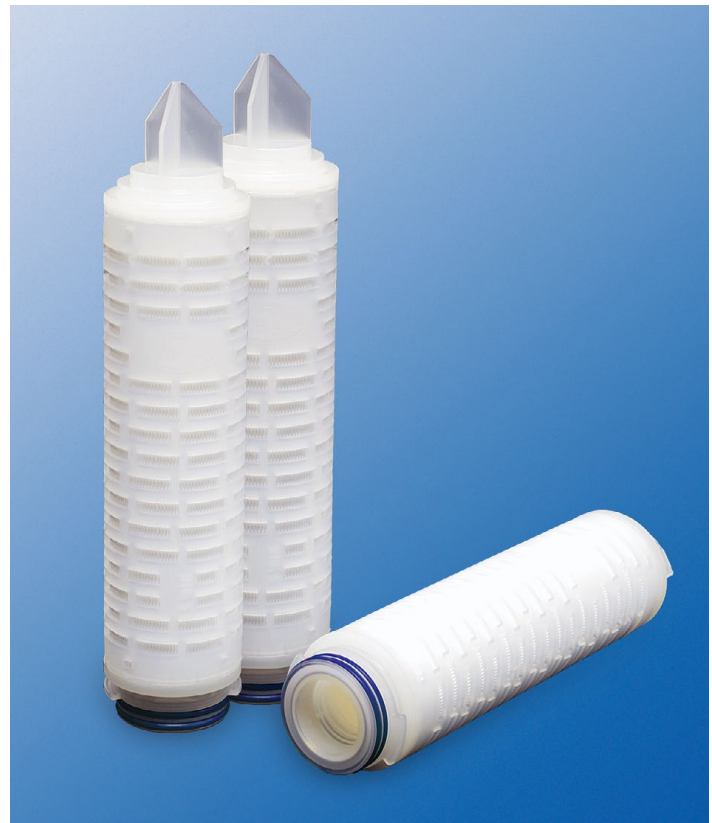
MEMBRACart XP Filter Cartridges

Please refer to the Pall website http://www.pall.com/foodandbev for a Declaration of Compliance to specific National Legislation and/or Regional Regulatory requirements for food contact use.