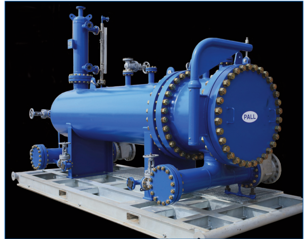
37-Around Simplex High Flow coalescer rental skid (closure view) 1