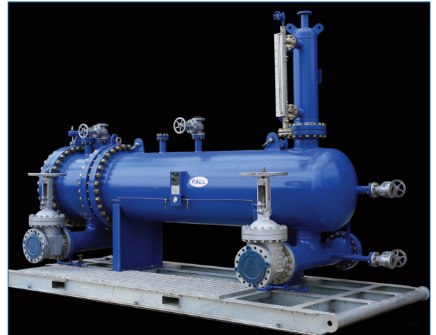
37-Around Simplex High Flow coalescer rental skid (side view)