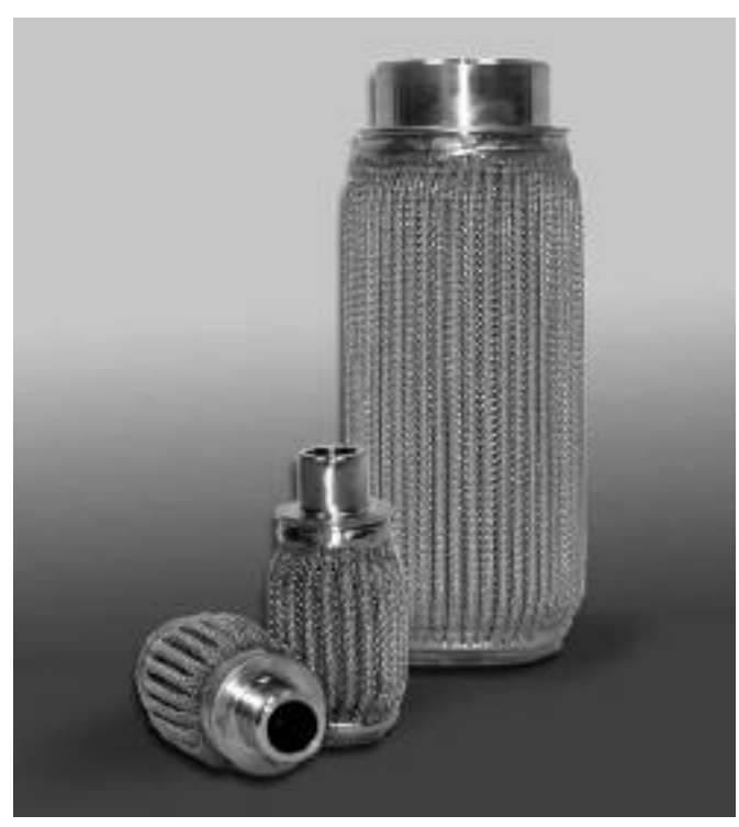
Pall Fit Series 63.5 mm/2.50" and 149.6 mm/5.89" elements shown