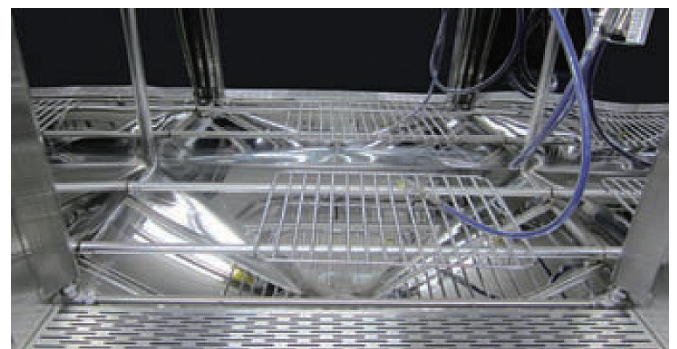
Component cleanliness measurement in a controlled stainless steel environment