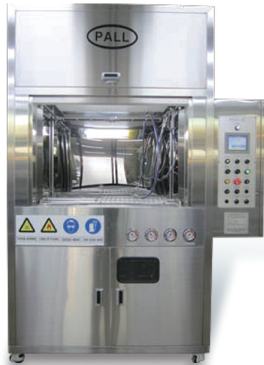
PCC41-KC, Pall Cleanliness Cabinet