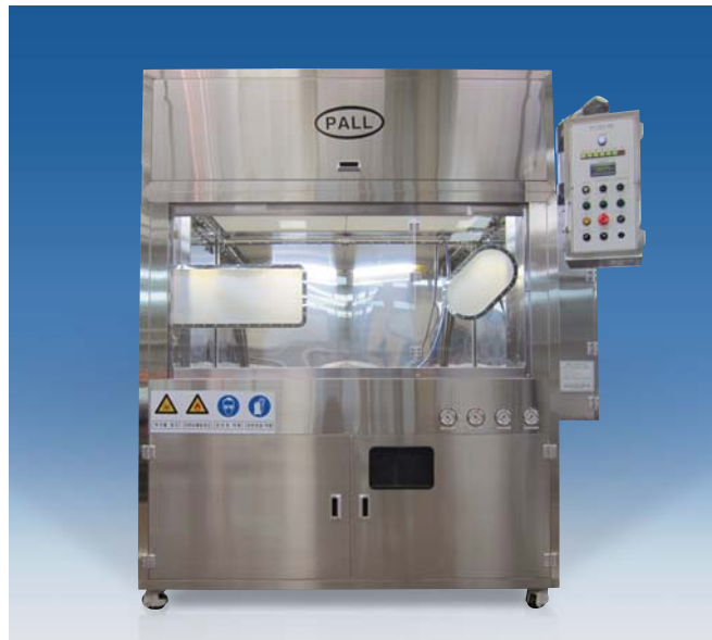
PCC81-KC Cleanliness Cabinet