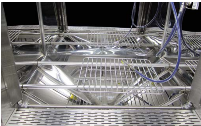
Component cleanliness measurement in a controlled stainless steel environment