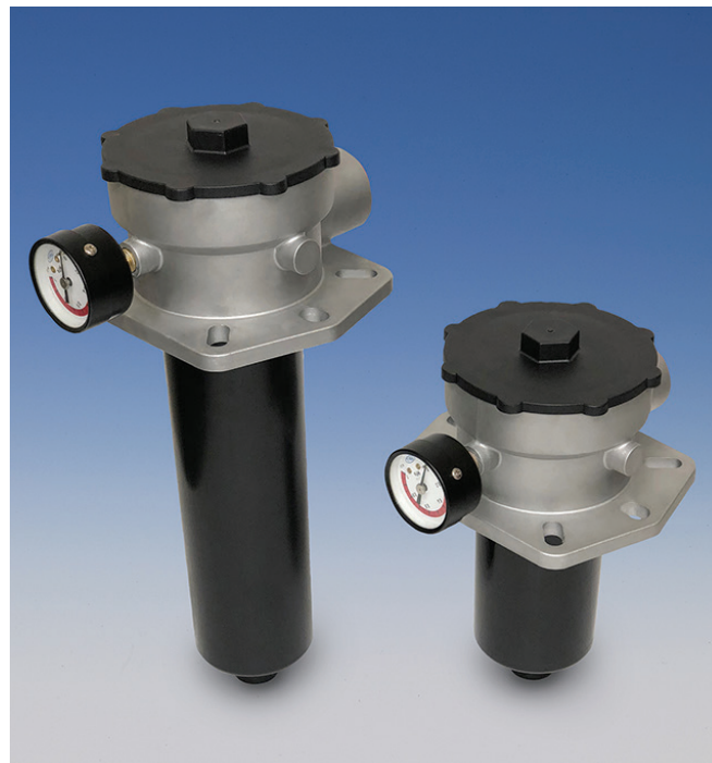
T200 Series Filter Housing