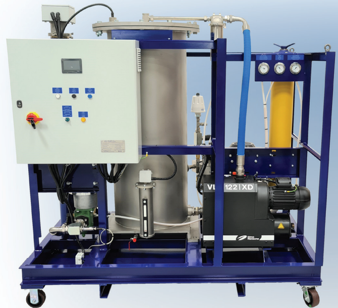
HDP50 Series Oil Purifier

Controlling the dissolved as well as the free water in the reservoir is critical in ensuring the absence of free water during operation.