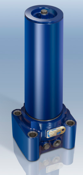
UH310 Series filter housing