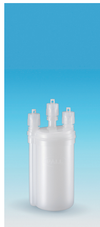
PE-Kleen SWD Capsule