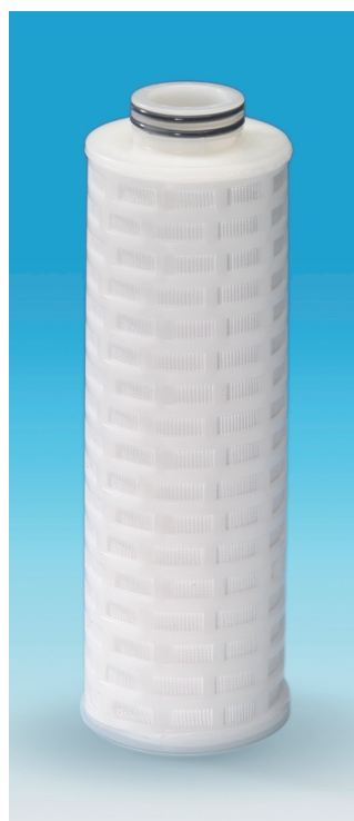
PE-Kleen G2 Filter