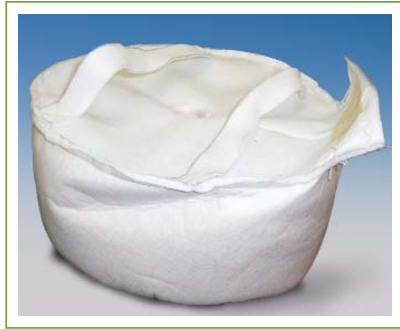
Treatment vessel: Contains three resin bags to capture varnish from mineral oil systems