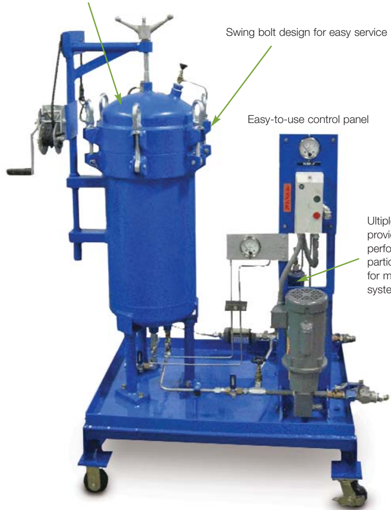
Swing bolt design for easy service