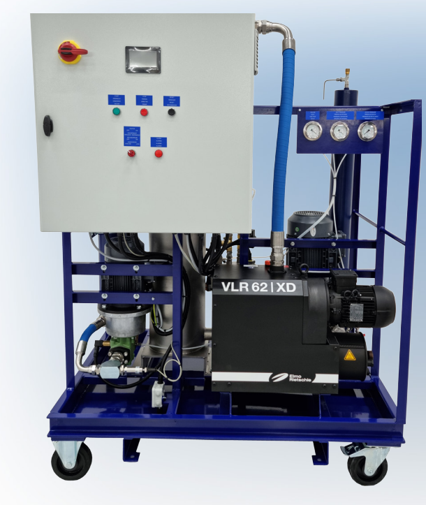
HDP10 Series Oil Purifier

Pall HDP Series purifiers standard features include: