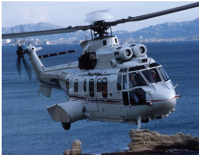
PUREair system for the AS332/EC725 Super Puma/Cougar helicopter