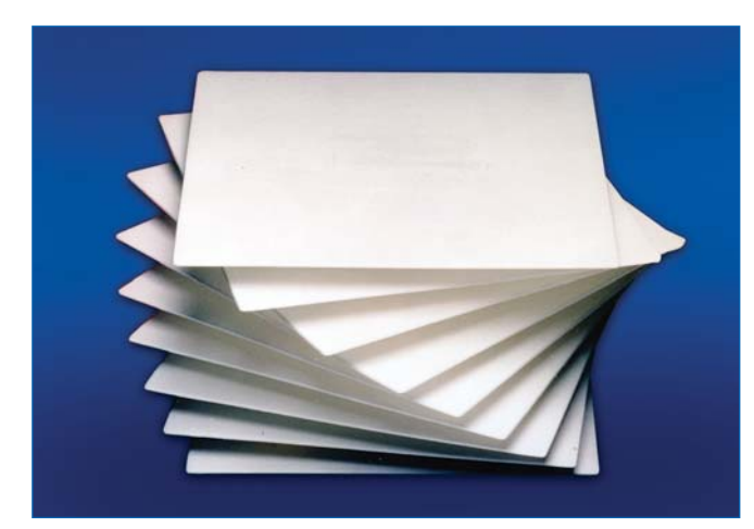
Seitz BS Series Filter Sheets