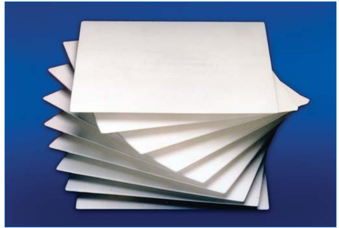
Seitz HR Series Filter Sheets