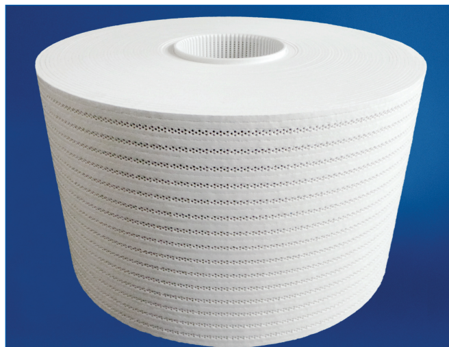
SUPRApak PW Series Modules

For High Throughput Depth Filtration in Enclosed Systems