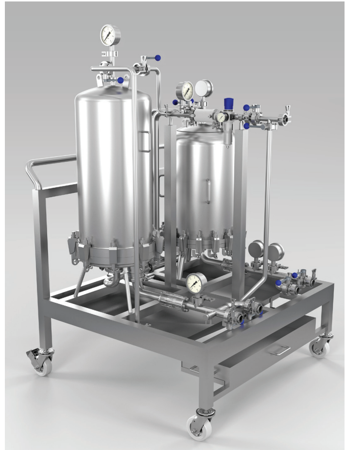
SUPRA Cannabis System C Series

SUPRA Cannabis System C Series units hold SUPRApak M modules, representing up to approximately 2.7 m 2 (29.1 ft 2 ) of filtration area in a very compact and low hold-up volume design. It is also designed to hold SUPRADisc II Modules and cartridge filters.