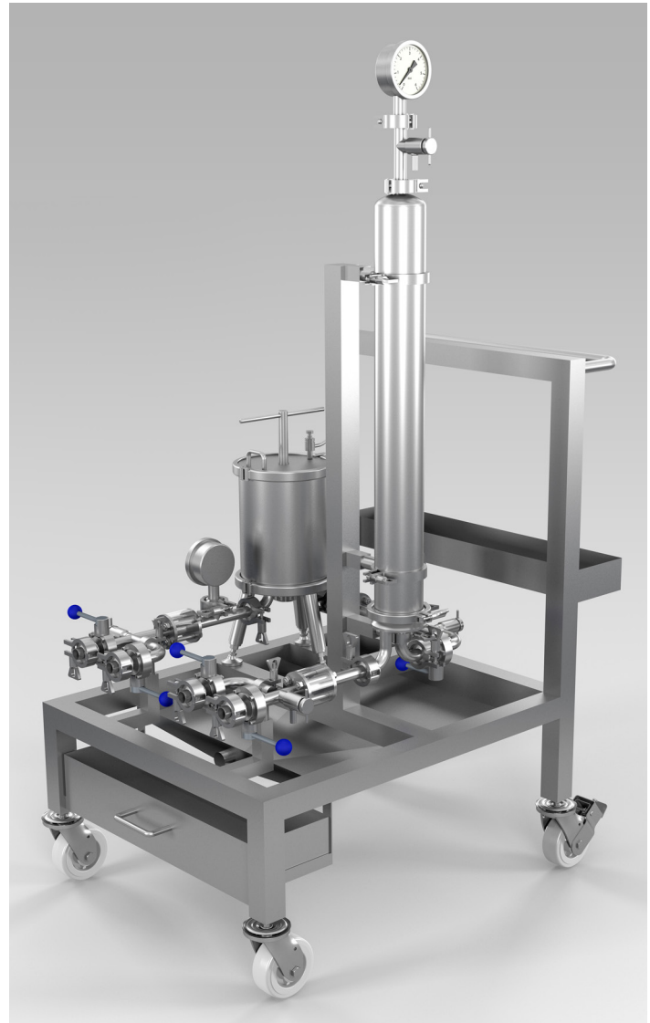
SUPRA Cannabis System S Series

SUPRA Cannabis System S Series units hold one SUPRAPak S modules, representing up to approximately 0.4 m 2 (4.3 ft 2 ) of filtration area in a very compact and low hold-up volume design.