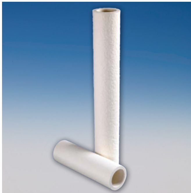
Medallion L/G Coalescer