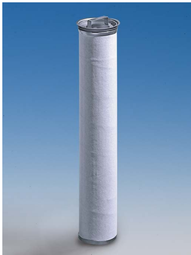
PhaseSep Liquid/Liquid Coalescer

The Pall PhaseSep system is a multiple stage system starting with filtration to remove particulate matter 1 , followed by either a one-stage or two-stage coalescer stack to separate the two liquid phases. PhaseSep coalescers will remove a liquid contaminant to a level of 15 ppmv and below over a wide range of conditions such as: