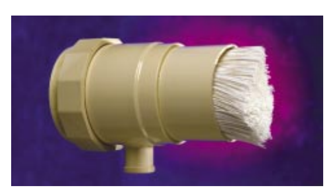
View of Hollow Fiber Membrane Module Cut-away.