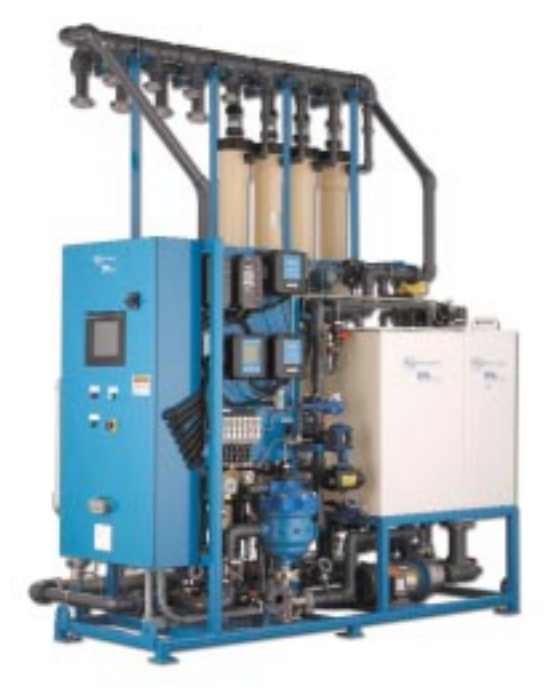
Pall Aria Water Treatment System with control panel and modules.