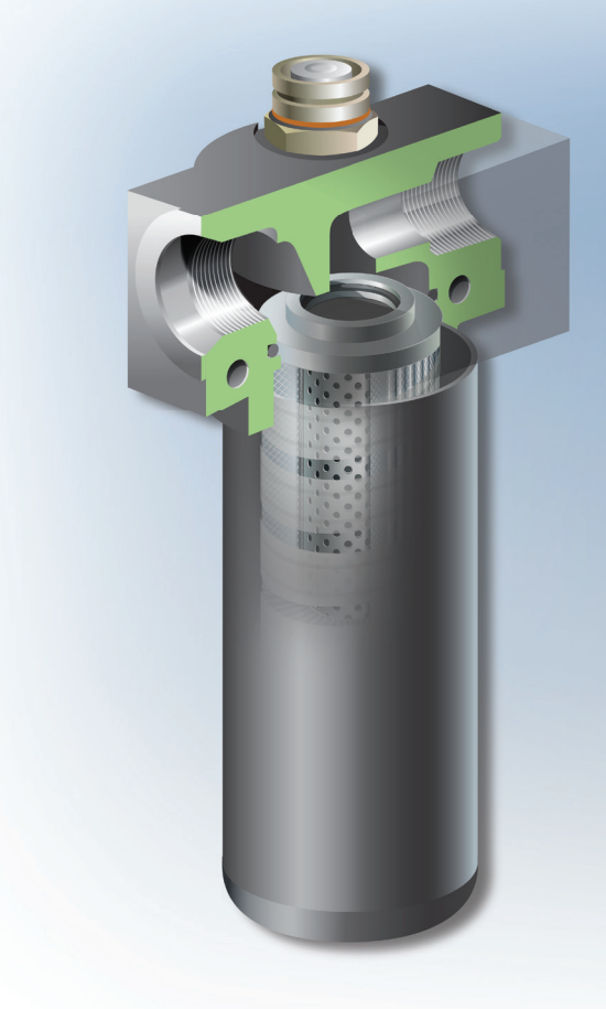
9021 Series Filter Housing