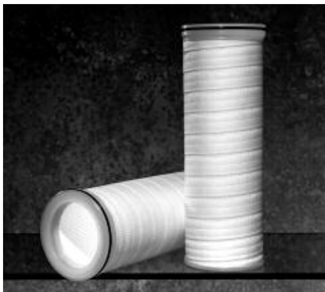
Ultipleat High Flow Elements