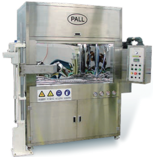
Pall PCC61-KC, Pall Cleanliness Cabinet