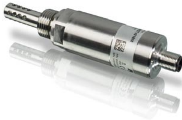
Pall WS12 Water Sensor

A more meaningful way to report water content is as a percentage of the water saturation level of the fluid for a given temperature. This method provides a better measure of how close the water content is to the formation of free water in the fluid. This allows action to be taken to bring the water content to an acceptable level before free water forms.