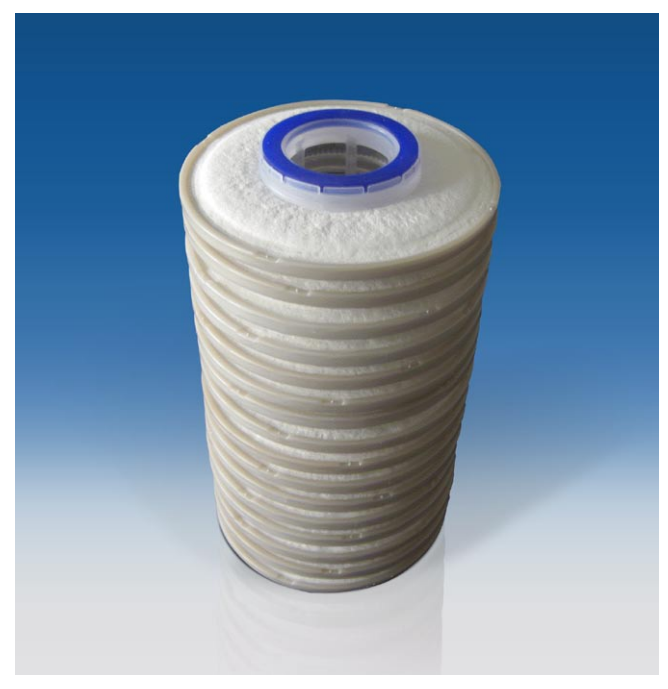
C.C.Jensen Series Upgrade Filter Element Assembly